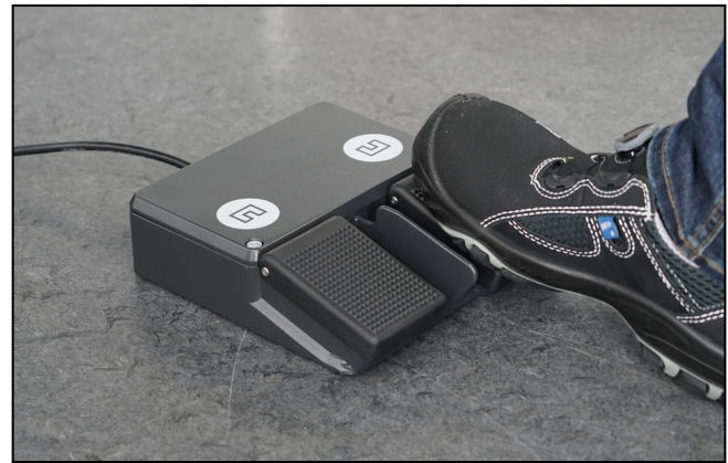
Pedal unit for opening and closing the pneumatic grips via foot operation