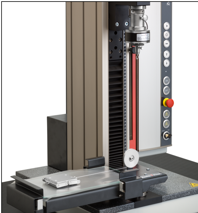
Device for testing the frictional properties of plastic films