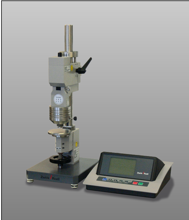
ZwickRoell 3105 combi test Hardness Tester